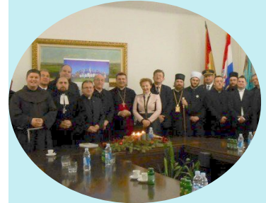
Only Protestant Pastor invited to Karlovac's 439th

Our vision: To build up the congregation, disciple new believers, offer basic seminary training and impact more lives for the Kingdom in a permanent facility.