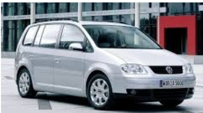
Our 2006 VW Tauren