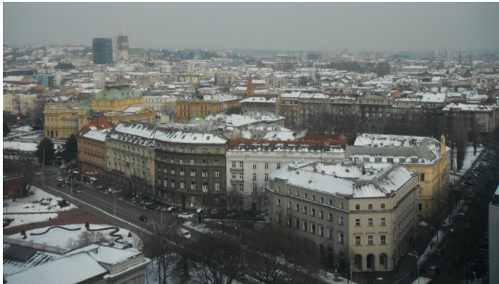
Winter comes to Zagreb

Why cross-current? Because the gospel of Jesus Christ which brings us near to God flows against the direction of the world .