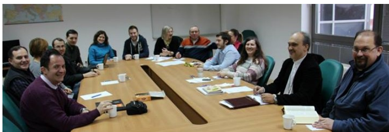
In a meeting with the staff at ETF in Osijek

“Znajte da molimo za vas” — “Know that we are praying for you” At the HKK Protest about discrimination against Protestants