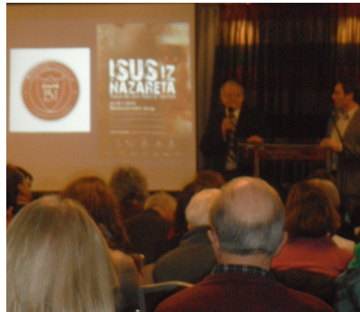
The Jesus Conference in Zagreb