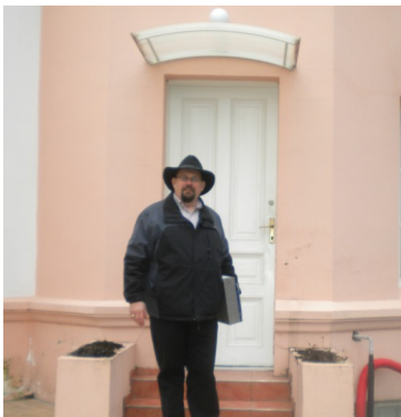
Outside the synagogue now a Pentacostal church at ETF in Osijek.