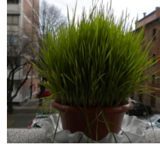
Our New Year's wheat grass— a Croatian tradition